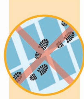
Never walk on solar panels.