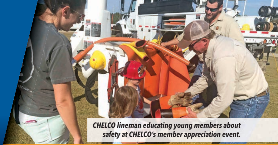
CHELCO lineman educating young members about safety at CHELCO's member appreciation event.