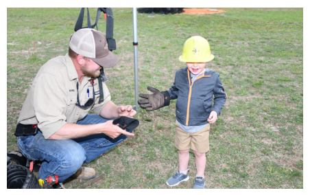
Our linemen brought some gear to share with our younger members!