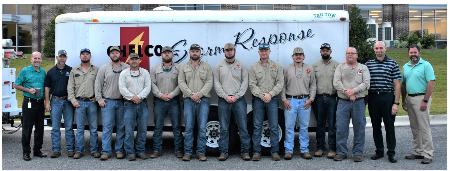
Our crew of 11 departed for Talquin Electric Cooperative on August 30, before moving on to Suwannee Valley Electric Cooperative. After 10 days helping restore power to thousands of members, they returned home safely. Thank you for your hard work!