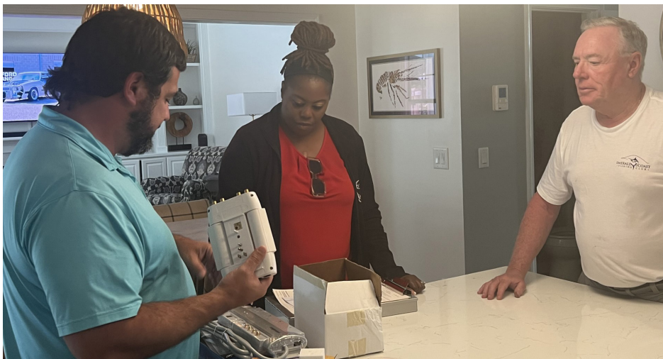
CHELCO Energy Advisors speak with a member during a surge evaluation.

Surge protectors are a relatively inexpensive solution that can be used on all types of buildings, particularly in areas like ours where a great deal of lightning strikes occur. When used alone, meter-based devices provide protection against lightning which might travel power lines attempting to enter your home through your incoming power service. In combination with other surge protection devices designed to protect electronic devices, the combination is capable of handling a broad range of electrical surges.