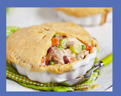
Turkey Pot Pie

Of course we'd share a turkey recipe in November! If you like turkey and chicken pot pie, then this is the recipe for you! Learn this recipe and more at CHELCO.com/recipes.