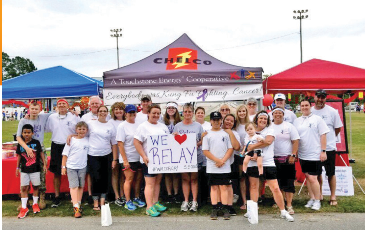
CHELCO's Relay for Life of Walton team in front of their "Everybody was Kung Fu Fighting... Cancer" campsite at Freeport Middle School.