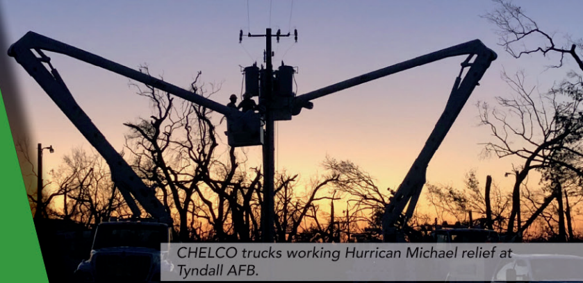
CHELCO trucks working Hurricane Michael relief at Tyndall AFB.