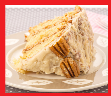
Italian Cream Cake

Satisfy your sweet tooth and enjoy a guilty pleasure with this delicious Italian Cream Cake. Learn this recipe and more at CHELCO.com/recipes.