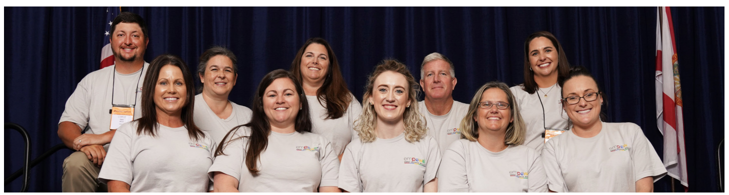
CHELCO's 2023 Empower Energy Education Workshop teacher group.