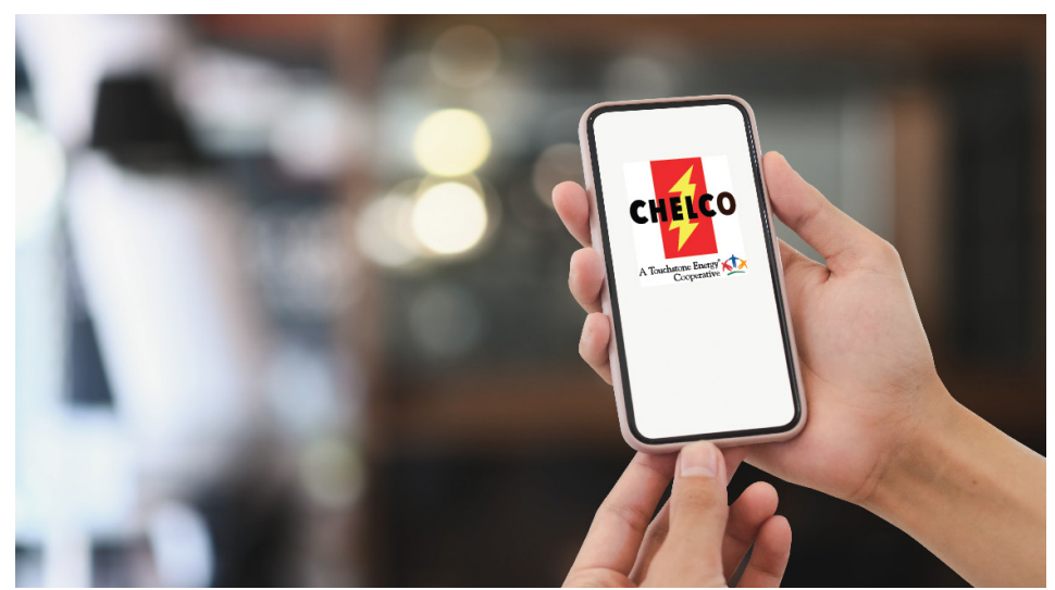
Members can expect a March 1, 2023 release for the new-look CHELCO app.

CHELCO will soon be getting an updated member app, which will feature essential tools necessary to pay your bill, monitor your usage, report and track outages, update your