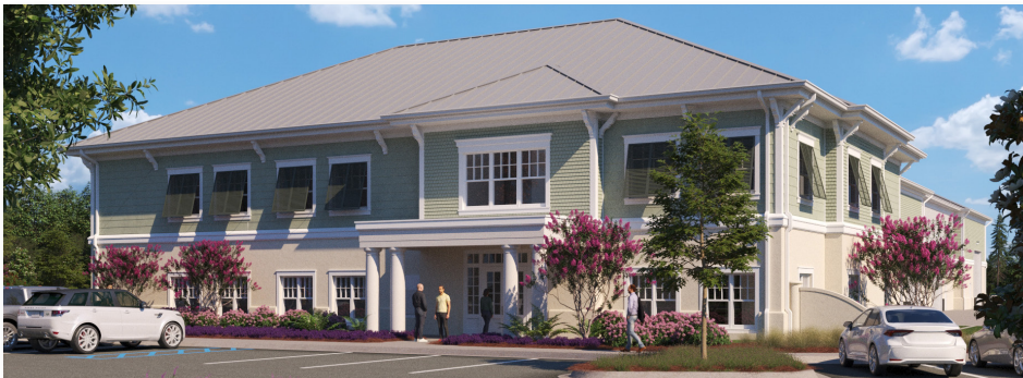
Renderings of the new CHELCO office and operations center in Freeport, Florida