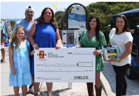
$400 - 30A Tiny Libraries June 2023

When Palmetto Electric Cooperative in South Carolina first launched Operation Round Up in 1989, they likely never imagined the lasting impact it would have. What began as a simple way for members to round their bills up to the next whole dollar to support local charities has since grown into a cornerstone initiative adopted by nearly 400 electric co-ops nationwide.