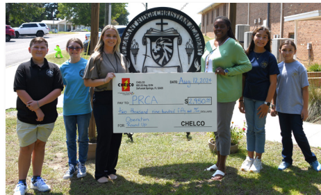
$2,950 - Pleasant Ridge Christian Academy August 2024

Operation Round Up has now provided more than $500,000 in funding through over 200 grants to nonprofits across our service area.