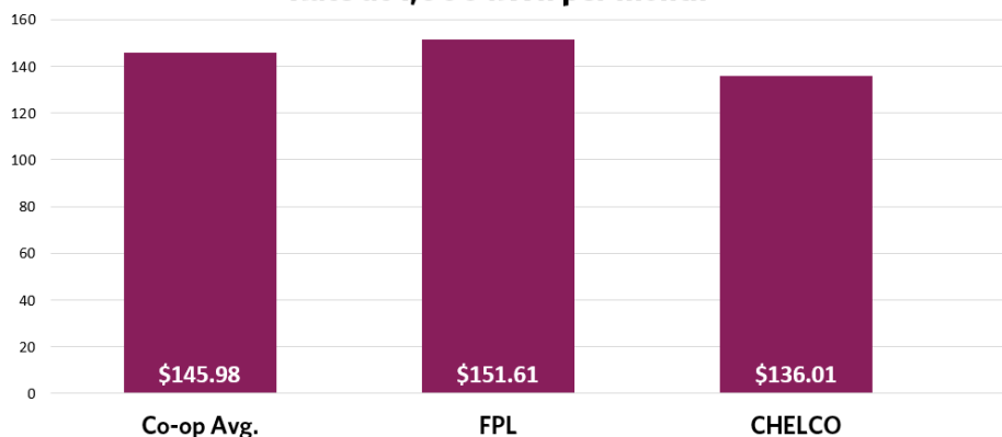
Rate at 1,000 kWh per month

"It's always useful to compare your own statistics and figures with those of your peers," Rhodes said. "In reviewing our rates, I'm very pleased with where we stand, and we will do everything we can to keep our rates affordable for many years to come."