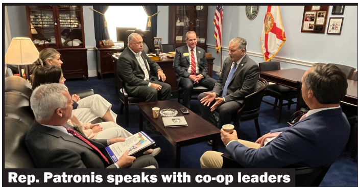
Rep. Patronis speaks with co-op leaders