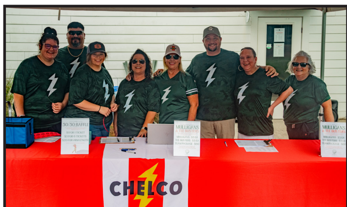
A few of the CHELCO team members who helped us host a very successful golf tournament. Thank you all!