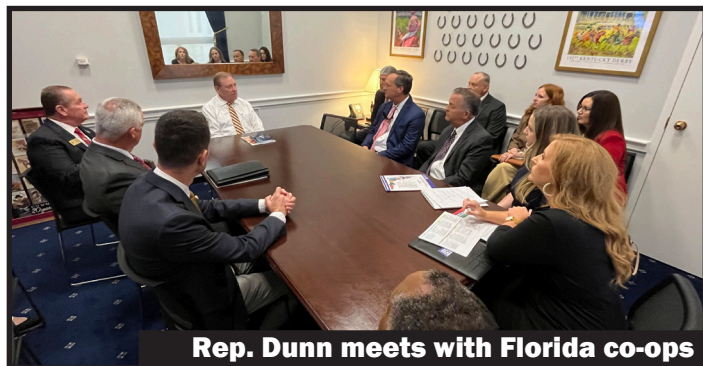
Rep. Dunn meets with Florida co-ops

In their meetings, CHELCO and other co-ops