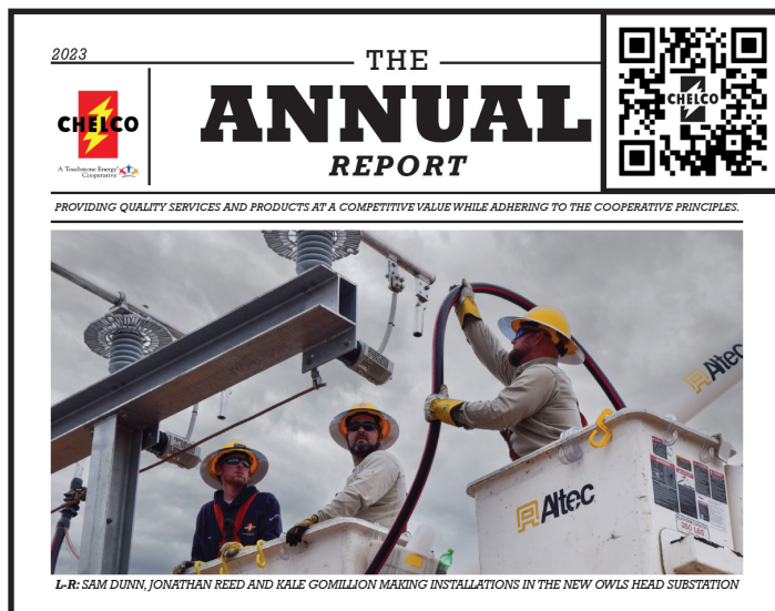
The award-winning Annual Report can be found at CHELCO.com by scanning the QR code above.

established categories. CHELCO's “Best Wild Card” recognition was awarded for our “CHELCO Chiller” ice cream cart, which debuted in 2024 and has been used at employee appreciation events and large group meetings.