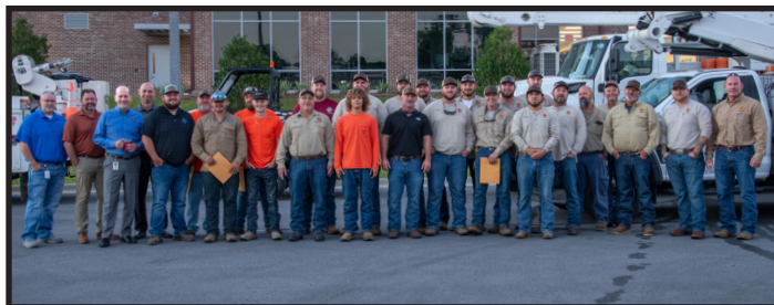
Our mutual aid crew from 2024's Hurricane Milton response

video, "CHELCO Mutual Aid: Hurricanes Helene & Milton."